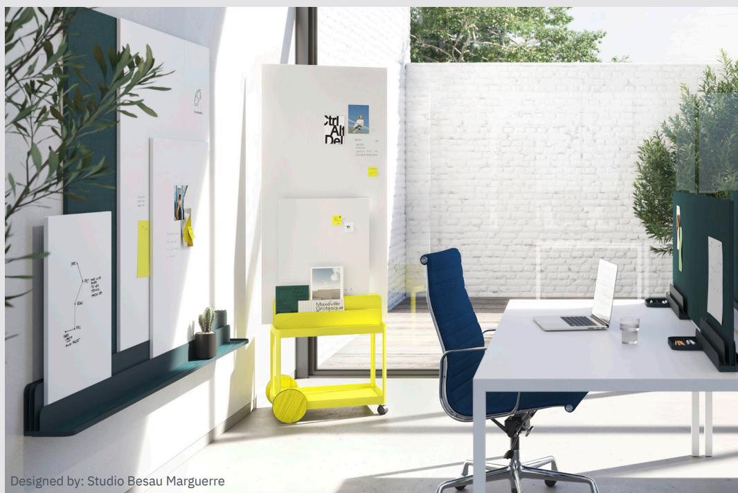
Designed by: Studio Besau Marguerre